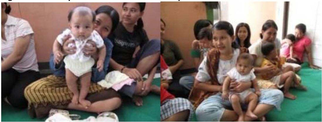
Figure 3.3 The impacts of crisis on children in peri-urban Jakarta

Left and right: the impacts on education of export sector job losses in Jakarta are unlikely to be direct: these workers are typically young and unmarried or parents of pre-school children. But as migrants, they also used to send remittances home to help with siblings' education, and are less likely to do so now.