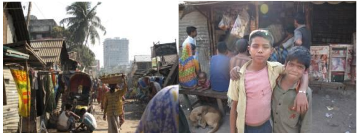
LEFT: entrance to Kalyanpur, Dhaka, one of the study locations. Most people who live there lost their land to river erosion in the south of Bangladesh. RIGHT, boys who make a living from the vangari (recycling) business in Kalyanpur. School dropout rates in Dhaka are among the highest in the country.