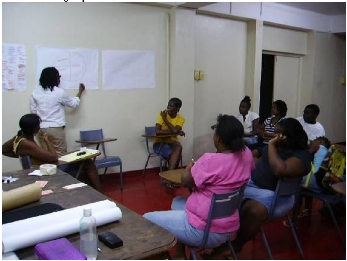
Figure 5.1 Focus group participants in Kingston analysing the impacts of the crisis on different social groups

There were reports of rising stress levels and arguments in households from many of the communities, and of rising domestic violence from some. In some contexts, violence was seen to be directed at children by parents: