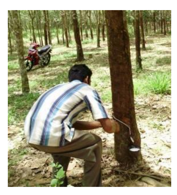
Figure 2.1. The picture on the left shows tapping of young rubber trees and on the right of older trees. This more labour intensive practice involves use of ladders and may involve reaching high up into the branches.

Source: Interviews with rubber workers, traders and owners, Banjar, Kalimantan, Indonesia.