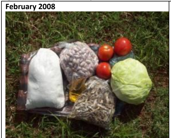
Figure 3.2 Comparison of prices and food items over a period of one year - rural Mpika

Items include: 2kg bag of mealie meal, 3 tomatoes, 50mls cooking oil, 100grams of Kapenta, 1 cabbage and 200grams of beans