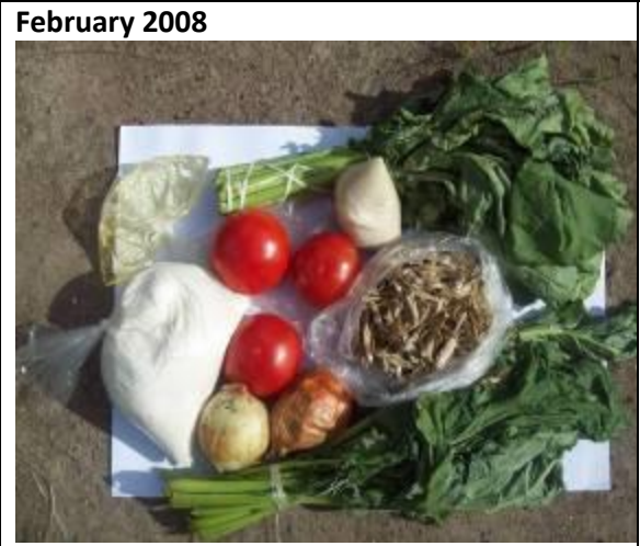
Figure 3.1: Comparison of prices and food items over a period of one year in Lusaka

Items include: 1kg bag of mealie meal, 3 tomatoes, 2 onions, 50mls cooking oil, 25grams sugar, 50grams of Kapenta and 2 bundles of vegetables