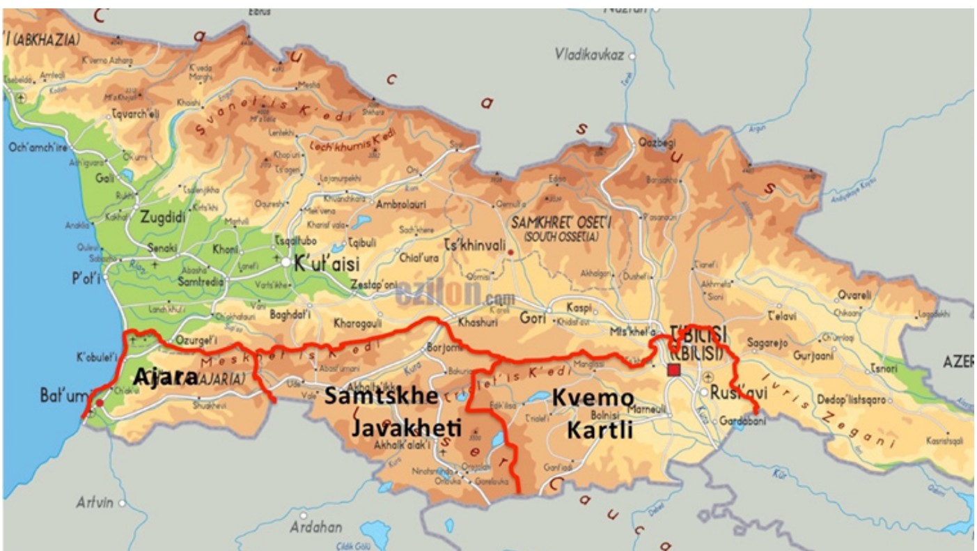
Figure 1: Alliances programme regions in Georgia's southern livestock producing region