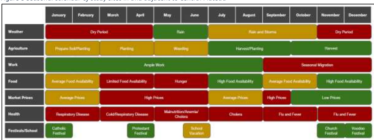
Figure 3 Seasonal calendar of study sites in and adjacent to Central Plateau

Figure 3 presents a seasonal calendar that maps how agricultural activities, food availability and other elements of daily life change over the course of the year. The calendar is based on conversations with community groups in each of the sites, and offers a colour-coded overview of seasonal differences across sites with green, yellow and red representing good, moderate and bad situations respectively. There are strong overlaps between sites but also differences due to their distinct geographical locations. Any notable differences across sites are noted in the discussion below.