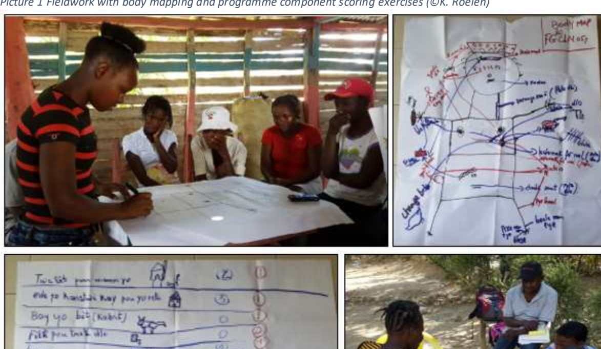
Picture 1 Fieldwork with body mapping and programme component scoring exercises

Primary qualitative data collection was grounded in participatory approaches and wide range of fieldwork activities was undertaken to elicit views, opinions and experiences across respondent groups. These include family mapping, daily activity clock, body map, programme component scoring and community mapping exercises at individual and group levels respectively. Table A3 in the Appendix outlines the various activities that were included. Research activities were co-constructed and developed during a multi-stakeholder research design workshop in January 2018. Fieldwork instruments were tested in February 2018 and data was collected in March and April 2018.