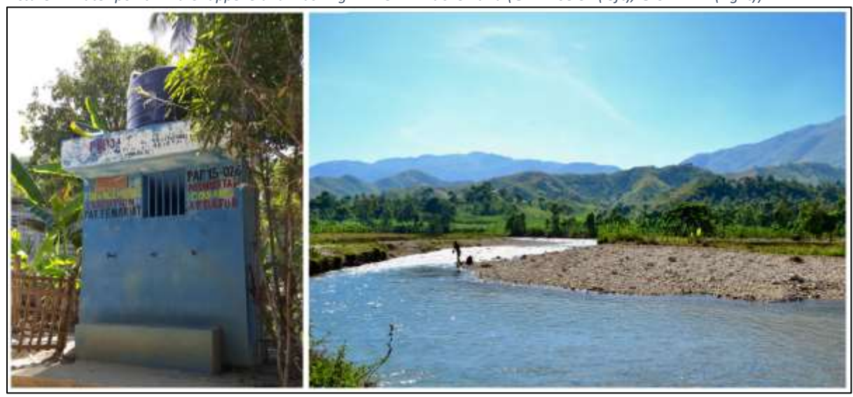
Picture 4 Water point in La Chappelle and washing in river in Mache Kana

The lack of availability of and access to basic services and infrastructure such as health care, schooling and early education and sources of clean drinking water presents a real barrier to improving early childhood development. One of the supervisors articulated this as follows: