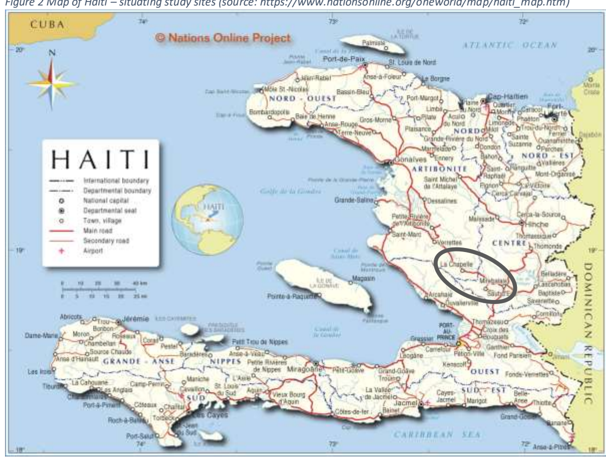
Figure 2 Map of Haiti – situating study sites

Figure 3 presents a seasonal calendar that maps how agricultural activities, food availability and other elements of daily life change over the course of the year. The calendar is based on conversations with community groups in each of the sites, and offers a colour-coded overview of seasonal differences across sites with green, yellow and red representing good, moderate and bad situations respectively. There are strong overlaps between sites but also differences due to their distinct geographical locations. Any notable differences across sites are noted in the discussion below.