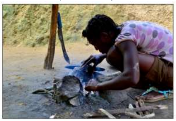
Picture 3 Mother and father undertaking household chores and interacting with their children

highlighted by one female respondent in response to whether her husband helps with activities around the house: "No, because Haitian men don't help out with cleaning". [LCCSCLM5-1]